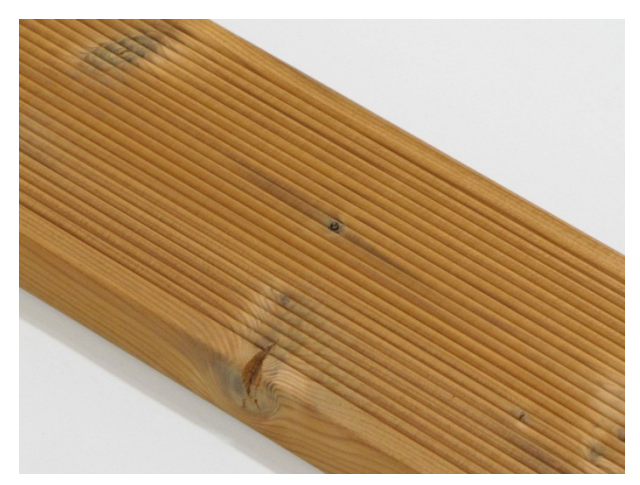
Small split of a knot on the edge is allowed.