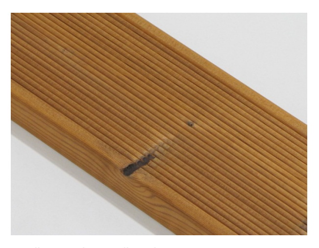
Small missing knot is allowed.