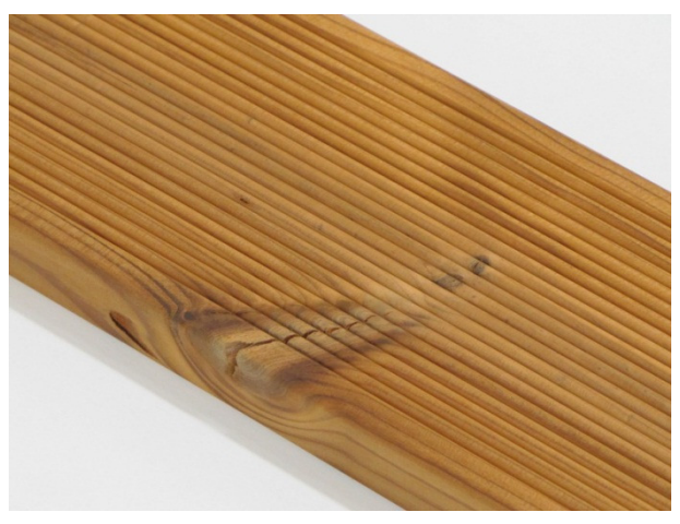
Single crack of a knot is allowed.