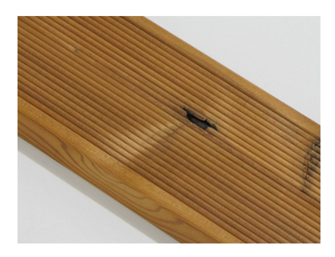
Small scars may appear.