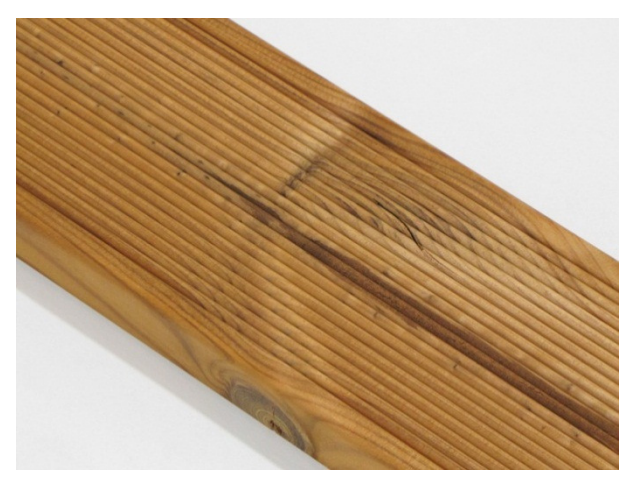
Small shakes on the surface are allowed.