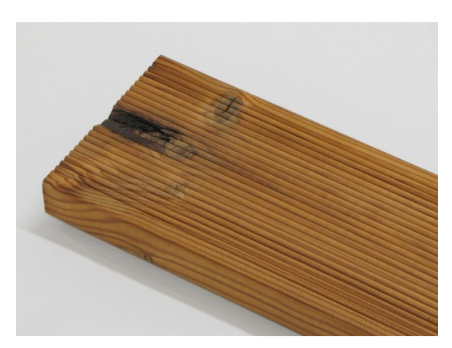
In general 8 cm from the ends of the boars are not sorted.