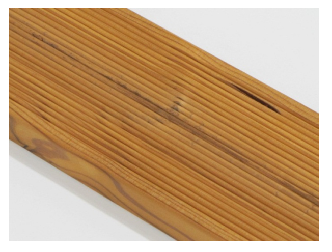
Pitch pockets are allowed