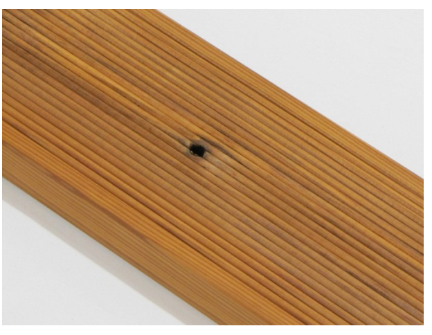
Small knothole (not throughout) on a board is allowed.