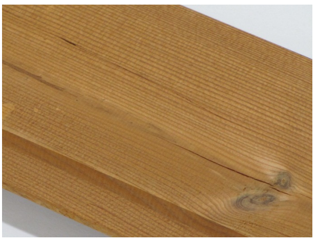
Small shakes on the surface are allowed.