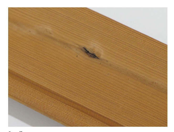
Small scars may appear.