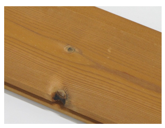
Small missing knot on the edge is allowed.