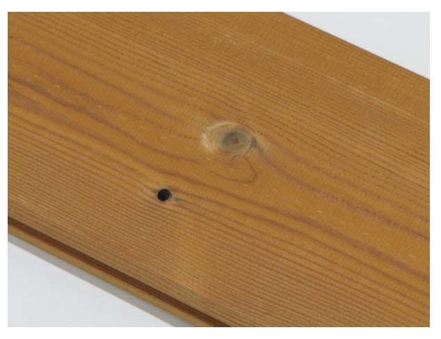
Small knothole (not throughout) on a board is allowed.