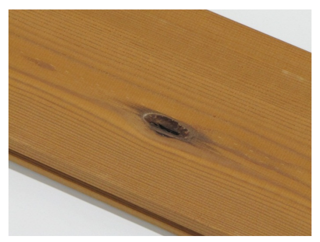
Pitch pockets are allowed.