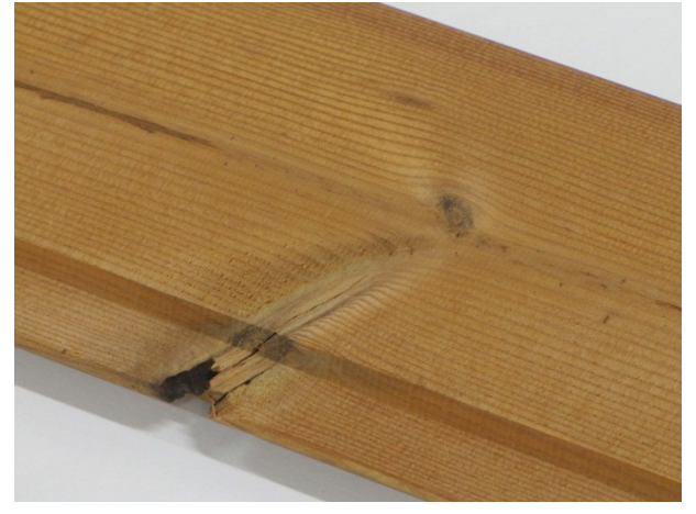
Defects which are unvisible after installation are allowed.