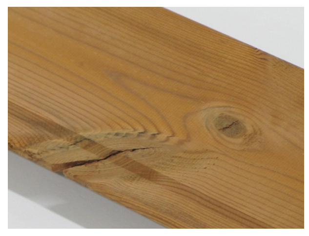
Single crack of a knot is allowed.