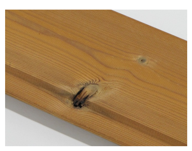
Small black knot on the edge is allowed.